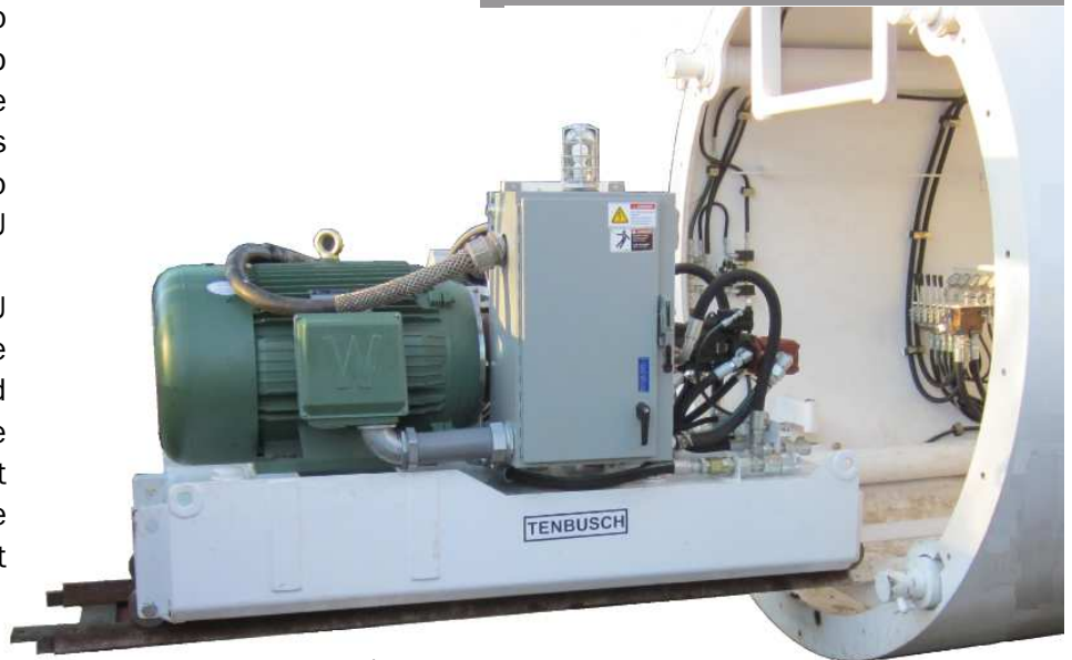
The picture above shows the right side of the HPU. This side was dedicated to the electrical components including the starter box.

This article was submitted by Tenbusch Inc., Lewisville, Texas. Tenbusch designs and manufactures heavy equipment for the underground construction and oilfield industries.