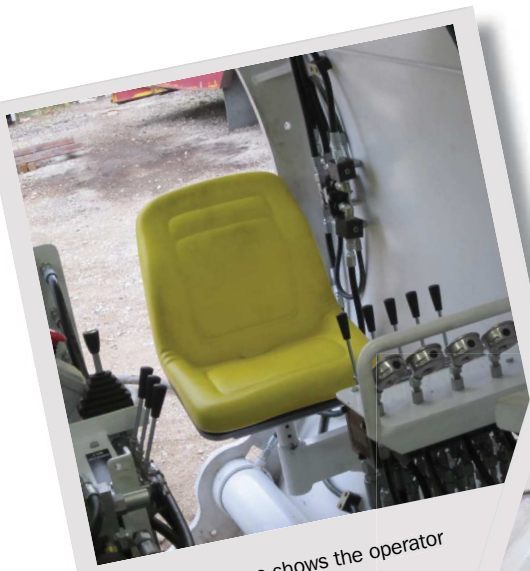
The picture above shows the operator location and controls

The thrust, steering and anti-roll fins controls were mounted in the shield. The conveyor and the two auxiliary circuit controls were mounted on the HPU. The drive motor control was also mounted on the HPU.